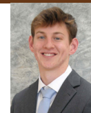
25 KNOTSMAN Fr. | G | 6-5

PPG 10.8 RPG 2.0 FG% 36.1% 3FG% 26.9% APG 0.8